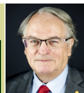
Prof. Dr. Stanley Whittingham Nobel Prize, Chemistry 2019